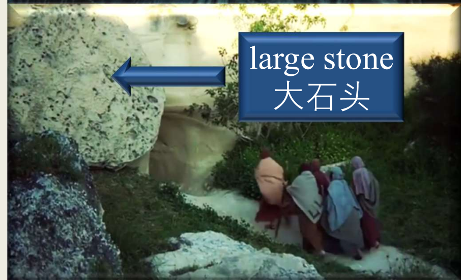
large stone 大石头